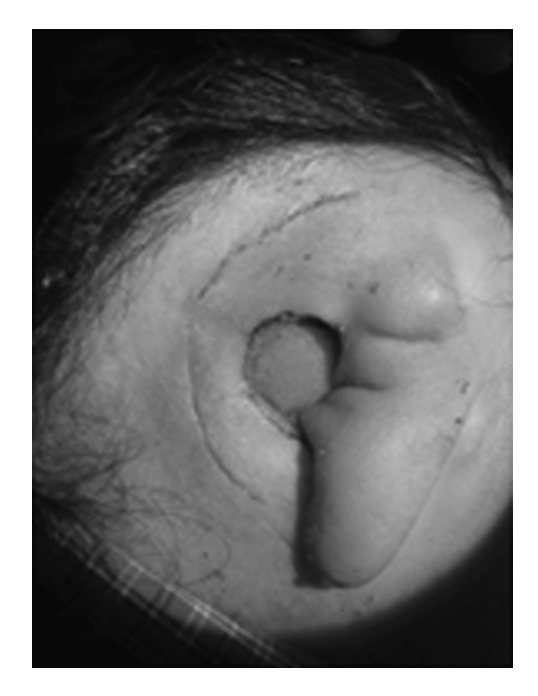
FIG. 2. Appearance of atresia reconstruction at 1 week postoperatively.

standard techniques. Results are reported in compliance with the American Academy of Otolaryngology–Head and Neck Surgery Committee on Hearing and Equilibrium guidelines for evaluation of the results of treatment of conductive hearing loss (HL) (8).